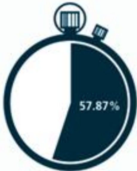
Rich Media with Video